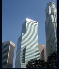
Citigroup Center Los Angeles, CA